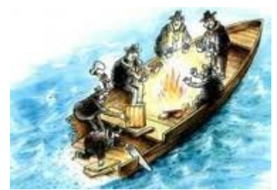
"Onen to those who don't follow the Two Row".

Section 91[24] of the BNA Act gave Canada authority to only "negotiate" with the Indians, not to make Admiralty statutes or rules for 'Indians, and Lands reserved for the indians". Section 109 provides a legal commitment to establish the ever growing $50.5 trillion Indian Trust Fund from the exploitation of our resources.