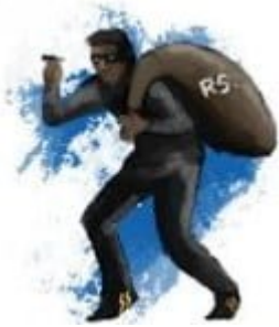
Carney, on the run with Indian Trust Fund.

Carney is now going to the UK with our $3 trillion. The Bank of England can't steal this money without him. They need the banker who knows these secret bank deals. Carney and the bankers are playing with the world's economy. They invest worldwide using our money to extract Indigenous resources from our brothers and sisters in other parts of the world.