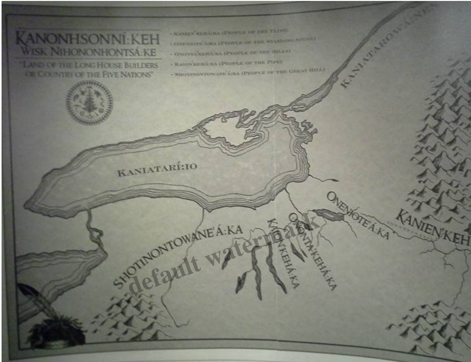
Part of the land of the rotino'shonni:onwe.