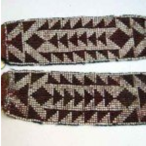
1710 Wampum, Peter the Great Museum of Archaeology.

Our message to the Corporation of Canada is to cease and desist any provocations, sanctions or threats against our ancient ally, Russia.