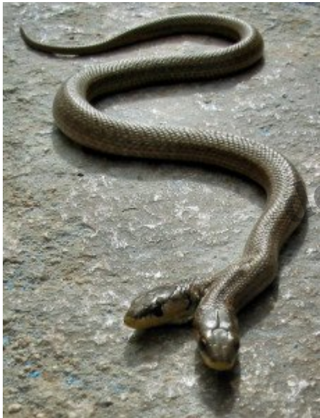
A two-headed creature: NYS and bar lawyers.