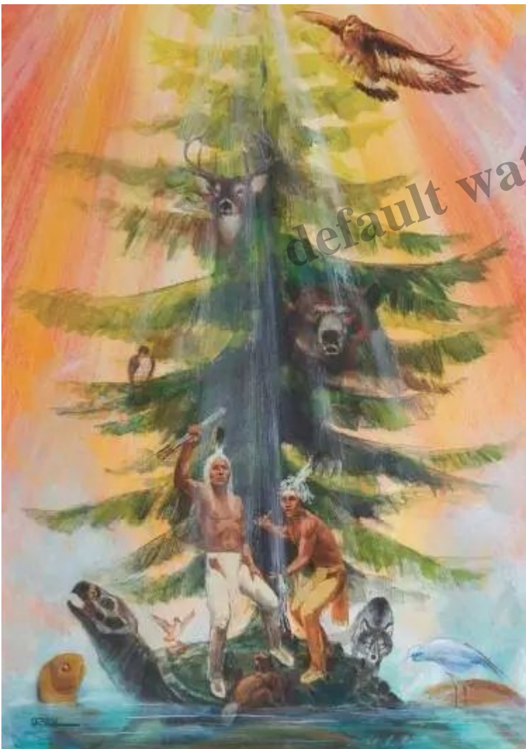
White Pine the great tree of peace