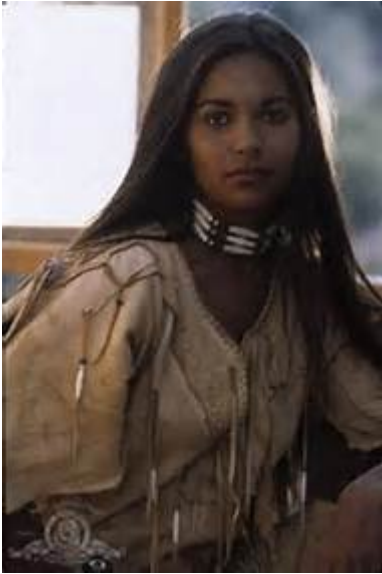
Sioux City Sue.

"This is the voice of truth, the voice you love to hate.