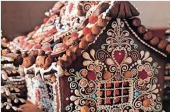
KHENTEKE MEETING PLACE

In khenteke, nobody dares to interfere with the people who are each sovereign and understand fully the great peace. Nobody can tell them what to think or do on their land.