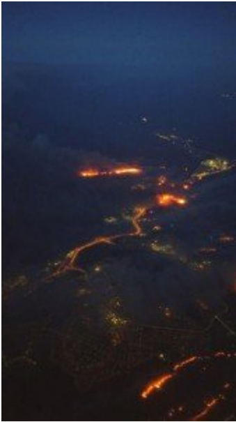
Looks like a controlled burn!

It appears the Hegelian dialectic is in play now with the Alberta wildfires. A problem was created so the colonial settlers would demand a solution, "Save us. Give us the pipeline"!