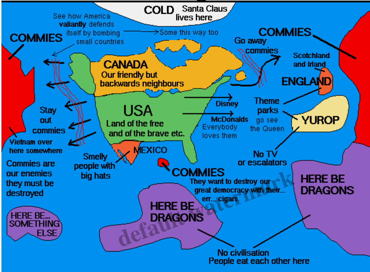
Bankers' world map.

All our gold years ago I time the biggest gold mine in the world, is gone. Three the Bank of Canada and went to the Bank of England with