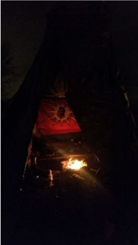
Kahnawake People's Fire. Trains blocked for 24 hours.

Bomb trains blocked for 24 hours by kanion'ke:aka/Mohawks.